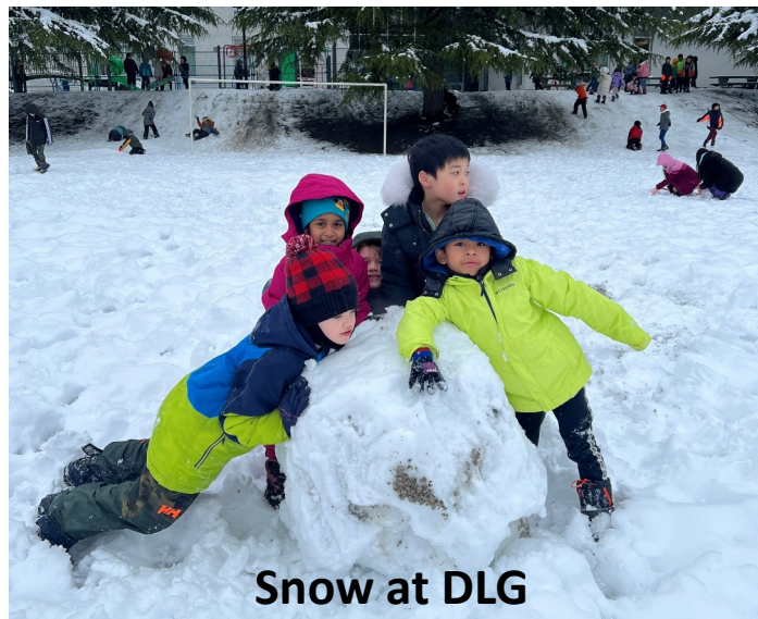
Snow at DLG