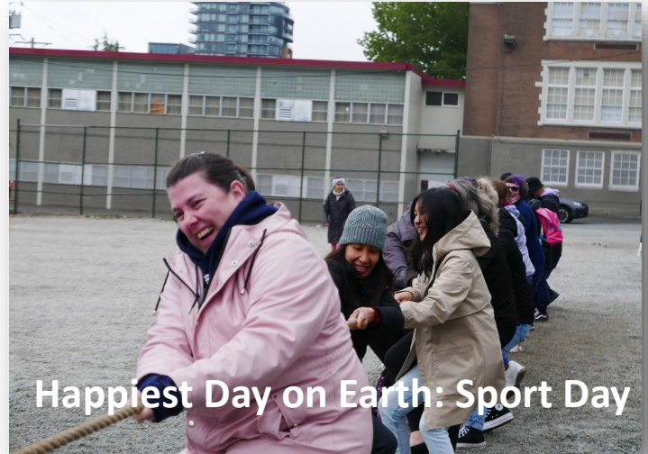
Happiest Day on Earth: Sport Day