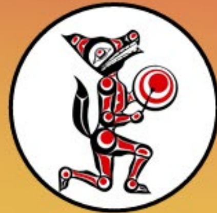
səlilwətaʔ (Tsleil-Waututh Nation)