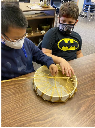
“We loved making the drum!” “We really liked making the handle.”