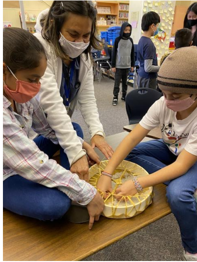
“I enjoyed weaving the sinew through the deer skin holes and hearing the sound.”