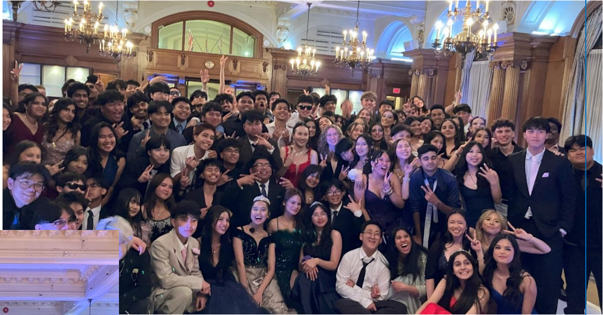
Prom at the Vancouver Club- 19 June

The staff and community of John Oliver Secondary wish you all the very best in the future!