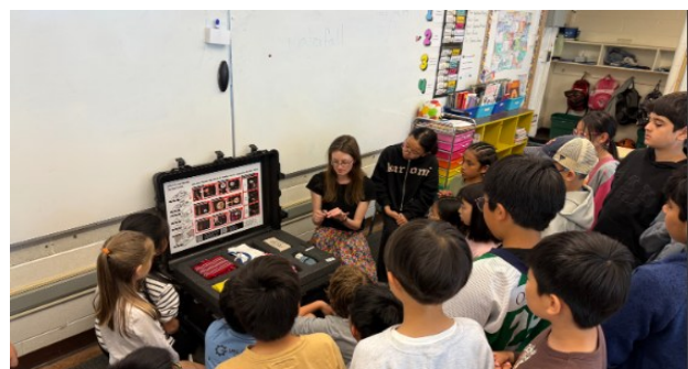
Div. 6 investigates artifacts borrowed from the Canadian Museum of History.