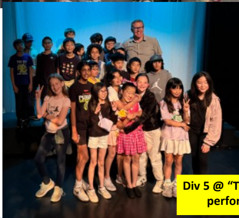
Div 5 @ "The Grunch" performance