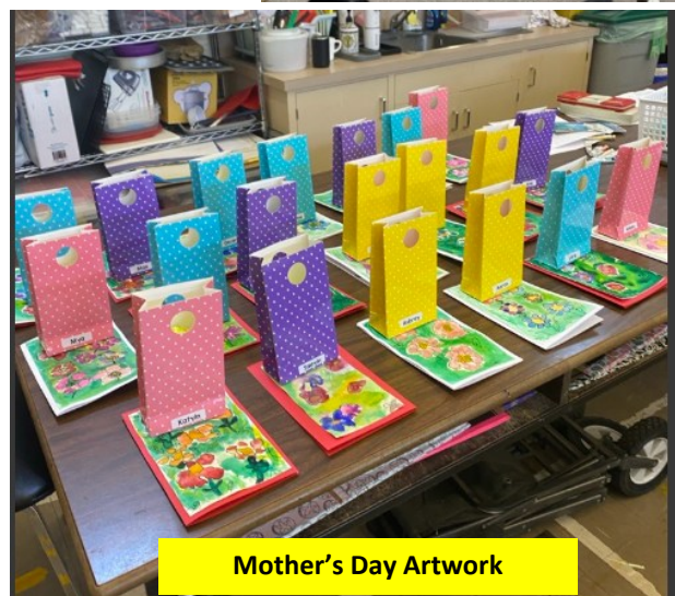
Mother's Day Artwork