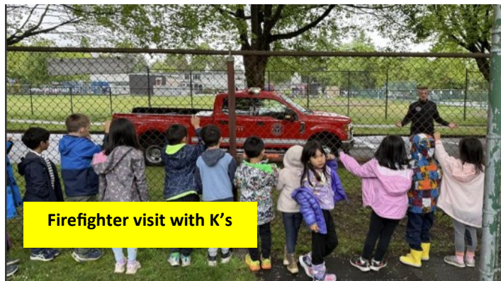
Firefighter visit with K's