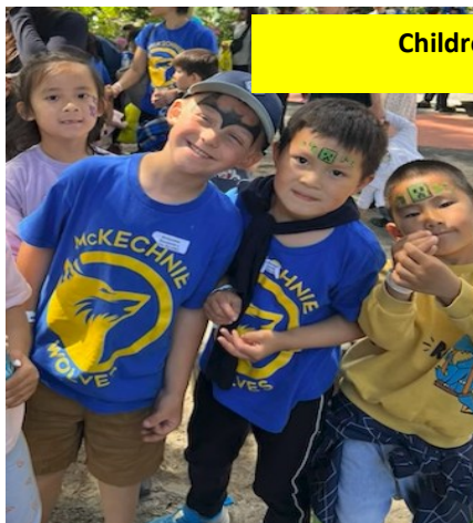
Children's Festival Field Trip—Divisions 11 & 12