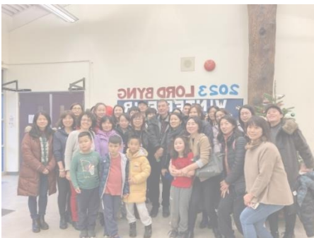
Figure 1 Parents, students and community volunteers take a moment to gather at the Winter Fair.