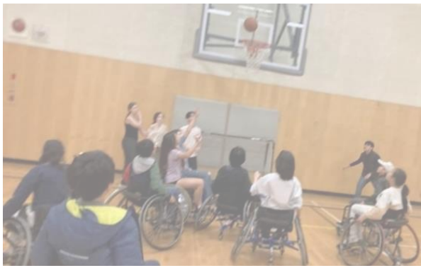
Figure 4 She shoots she scores!!!