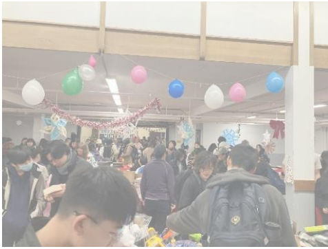
Figure 2 Parents and volunteers gather for the Winter Fair in the school Foyer and cafeteria and shop for holiday bargains in the open market.