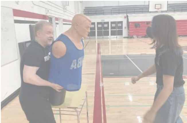
Figure 6 Grade 9 students learn about the art of self-defense in their Grade 9 PE class.

Again, this important unit reflects the Core Competencies of the Grade 9 PE curriculum.