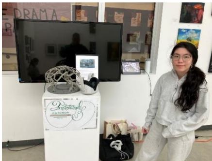
Figure 3 This student created a 3-D model of a garden installation that could be viewed in virtual reality

The Byng model of Capstone has all three of these components thanks to the leadership, design of program and support of our teachers.