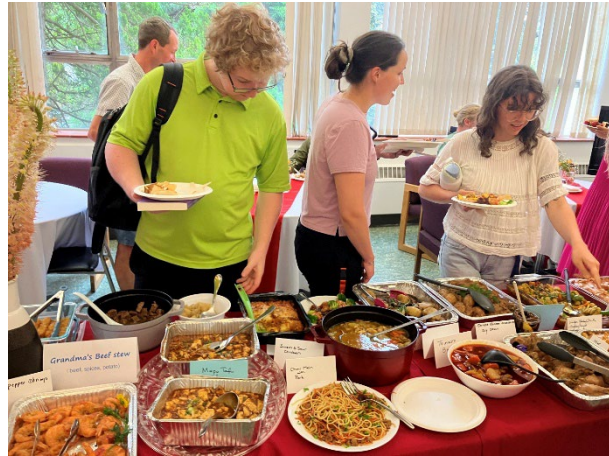
Figure 1 Thank you to all the members of the Byng PAC community for the incredible Staff Appreciation Lunch held on Thursday!!!