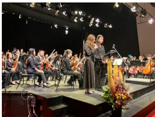
Figure 5 The year end LBSO concert opens with acknowledgements and introductions by LBSO Orchestra members.