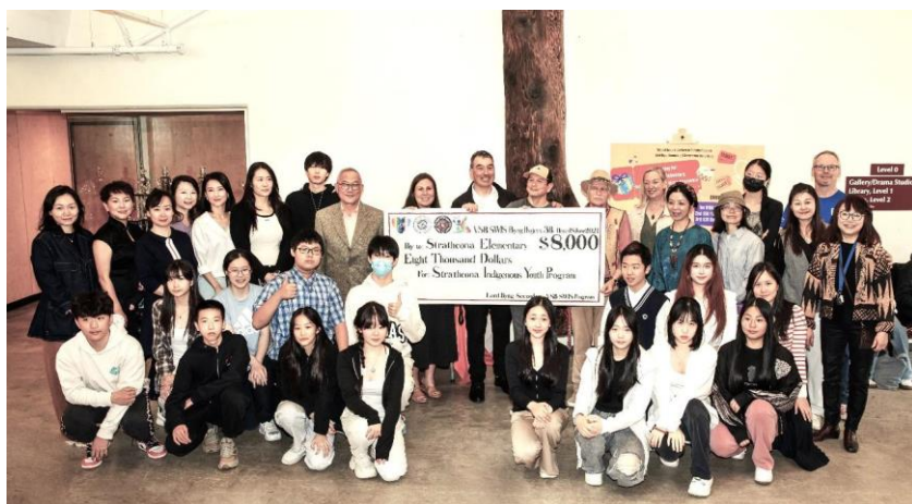
Figure 1 Byng Project 3B Leadership Teams celebrating the success of the fundraising initiative in supporting Indigenous Children in Strathcona Elementary!

On Tuesday (June 18) at lunch time, the Byng Foyer was buzzing with excitement in the air. Close to 200 youth leaders, parents, school admins, teachers, staff, and guests from Strathcona Elementary, as well as the Newcomer Welcome Center, gathered at the Strathcona Leadership Recognition & Raffle Draw event. They were there to celebrate the incredible team efforts to have successfully fundraised $8,000 to purchase much needed learning supplies to support the Indigenous Youth Program at Strathcona Elementary, our Vancouver Eastside sister school!!