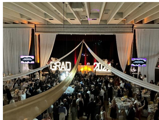
Figure 4 A night to remember for the Grads of 2024 at the Hellenic Centre Dinner and Dance

After an incredible evening at the Chan Centre recognizing the accomplishments of the Class of 2024, it was another memorable evening for the Grads of 2024 and their families to celebrate once again during the dinner and Dance held at the Hellenic Centre on Saturday evening.