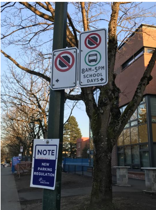
New Bus Zone on 10 th – NO STOPPING HERE!