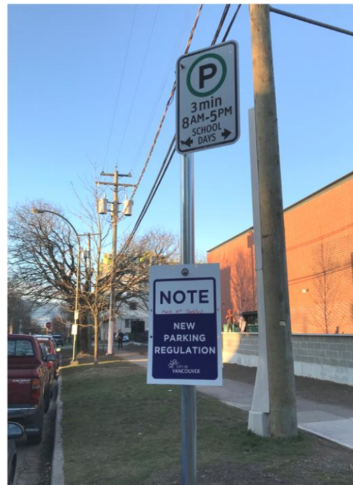
New Pick-up/Drop-off Zones on Maple/11 th