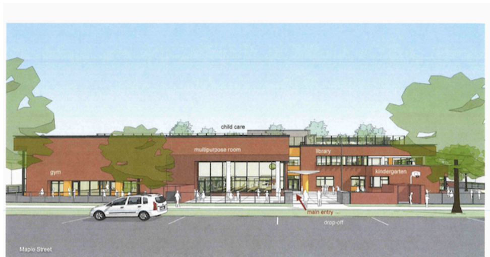
Lord Tennyson Elementary School + Child Care Centre

Work continues to progress on our new school building. Thank you to the crews at DGS as they continue to work on this project; We very much appreciate their ongoing work and commitment to this project that is so important to our community.