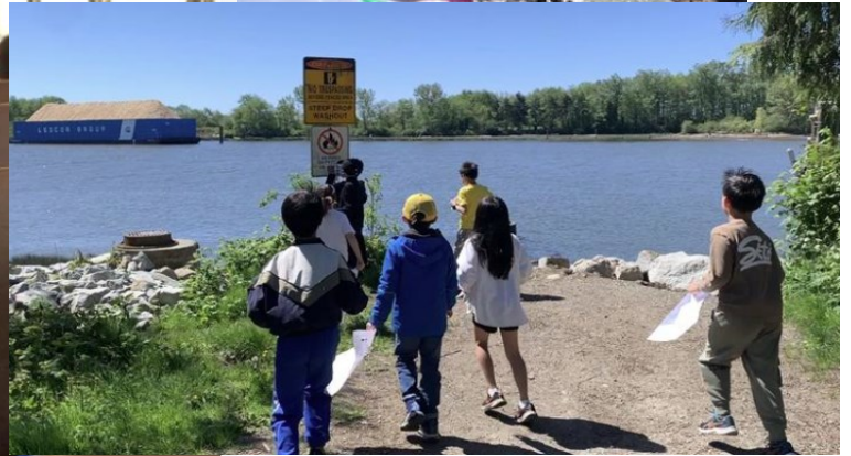
Fraser River Walk (Div 5 & 6)