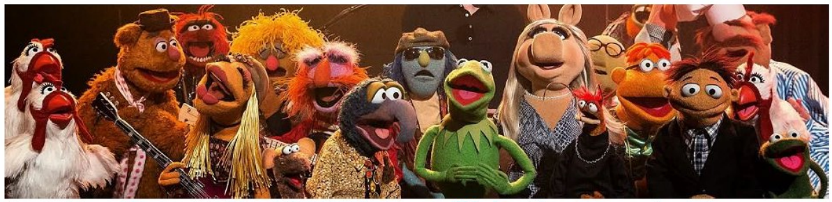
(diverse music and diverse singers – well behaved monsters welcome)