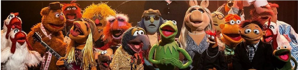
(diverse music and diverse singers – well behaved monsters welcome)