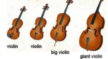
How other people see it:

(Please email return to gquan@vsb.bc.ca by June 17th)