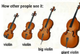
How other people see it:

(Please email return to gquan@vsb.bc.ca by June 17th)