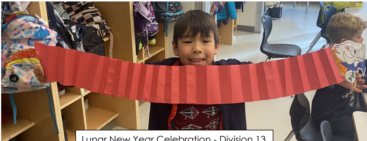
Lunar New Year Celebration - Division 13