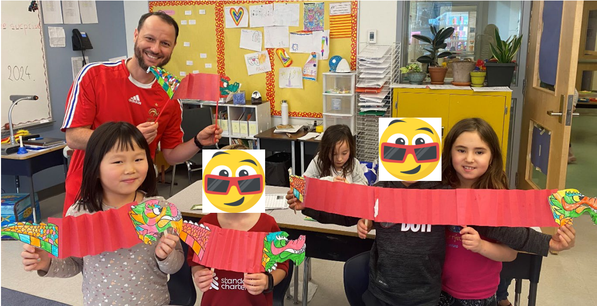
Lunar New Year Celebration - Division 13