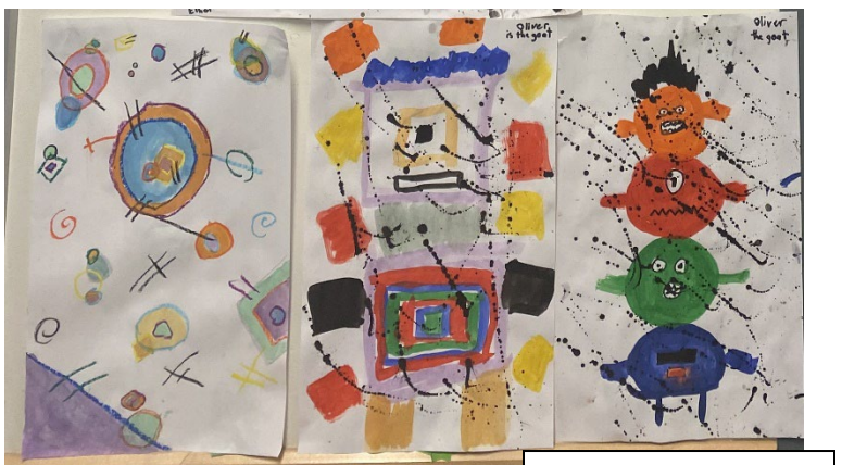
Art by Division 4