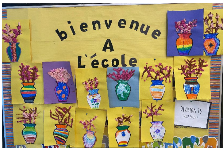
DIVISION 15 ART