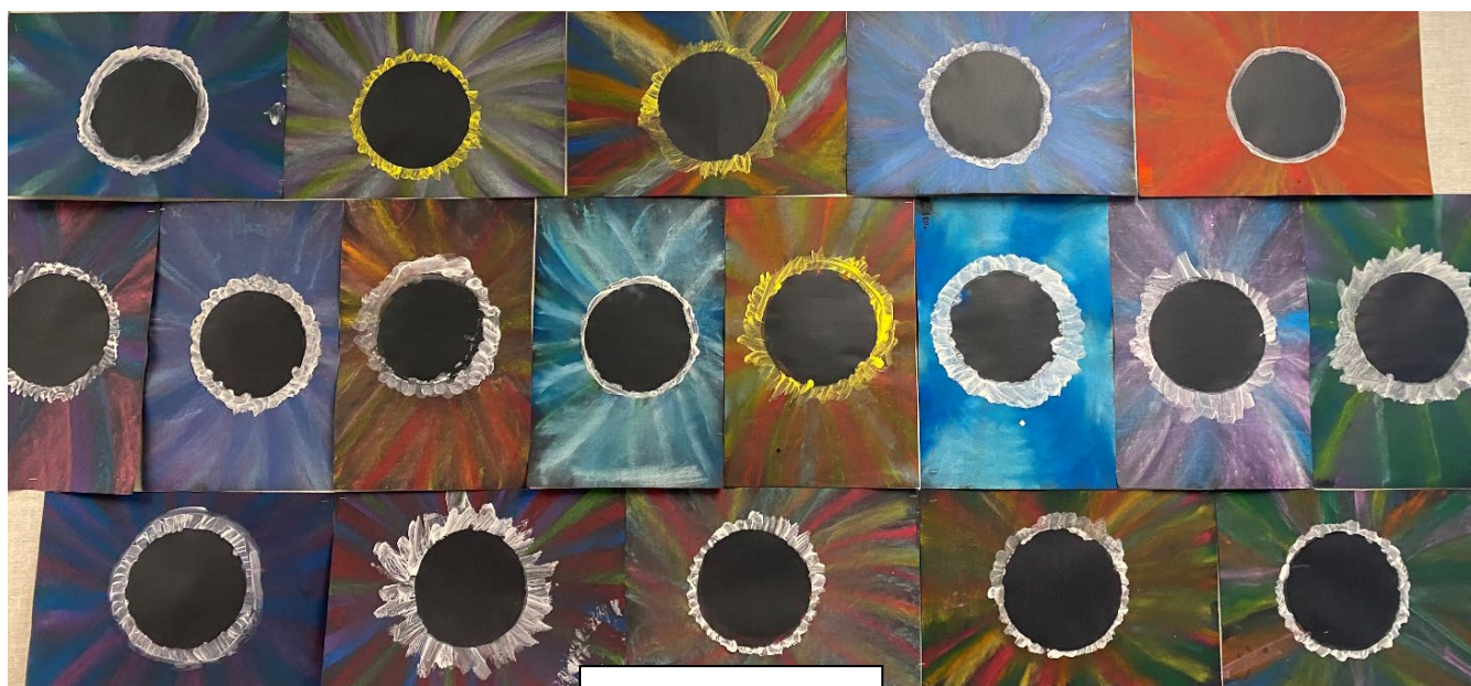
DIVISION 9 ART