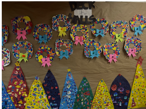
Kindergarten Holiday Art