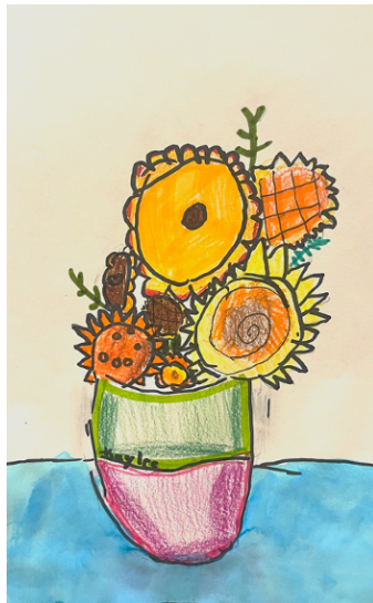
van Gogh inspired Art div. 8