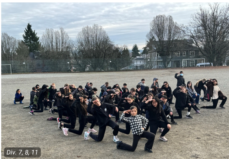
Div. 7, 8, 11