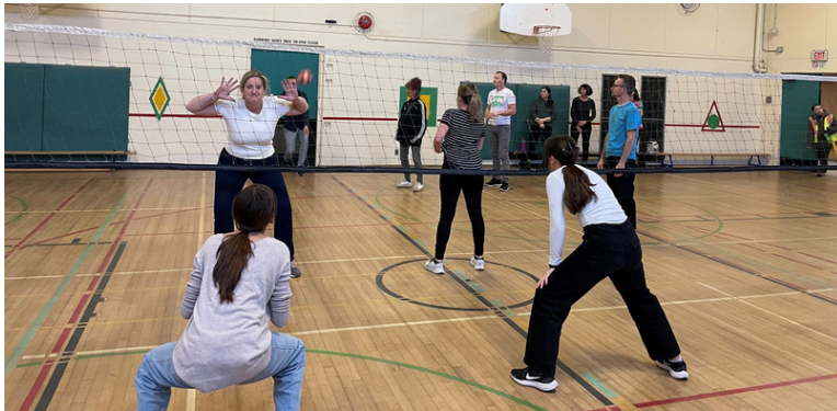
Staff vs. Grade 7 students volleyball game