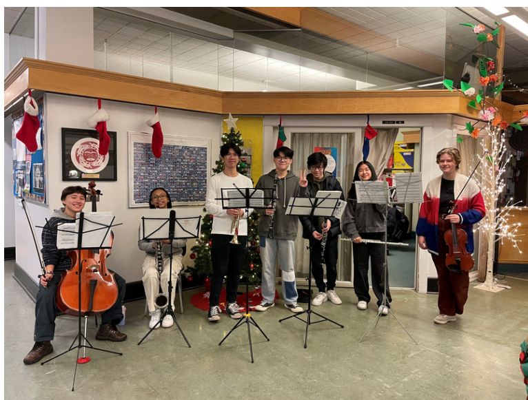
Thank you Van Tech Outreach Band for brightening up our morning with fantastic holiday music!

Given the busyness of this area, traffic enforcement does make regular check ins around the school. They will be around Norquay this week. We are still looking for volunteers to support the adult crossing guard program, the time commitment is very little, please consider signing up at: https://forms.gle/qeSRqRv4A4REUCXf6 . Thank you for your support in keeping our students safe.