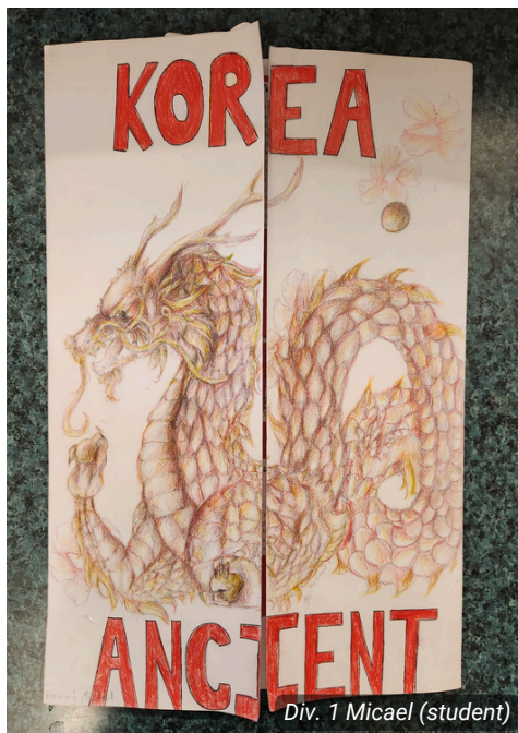
Div. 1 Micael (student)