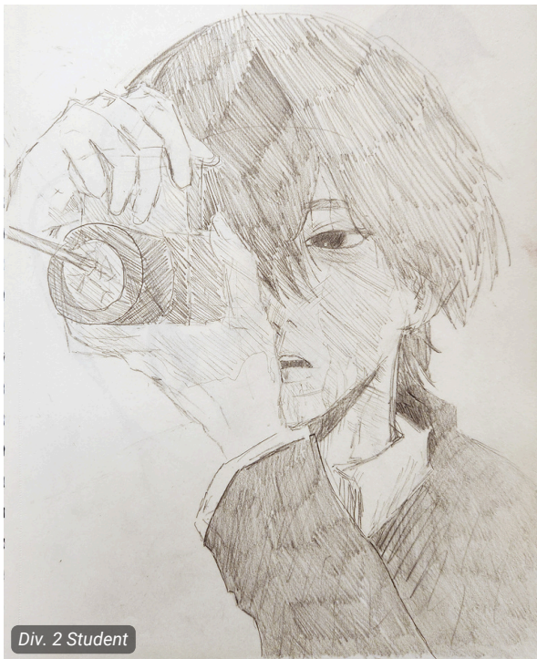
Div. 2 Student