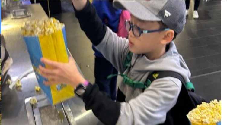
@ The Wild Robot Movie Field Trip