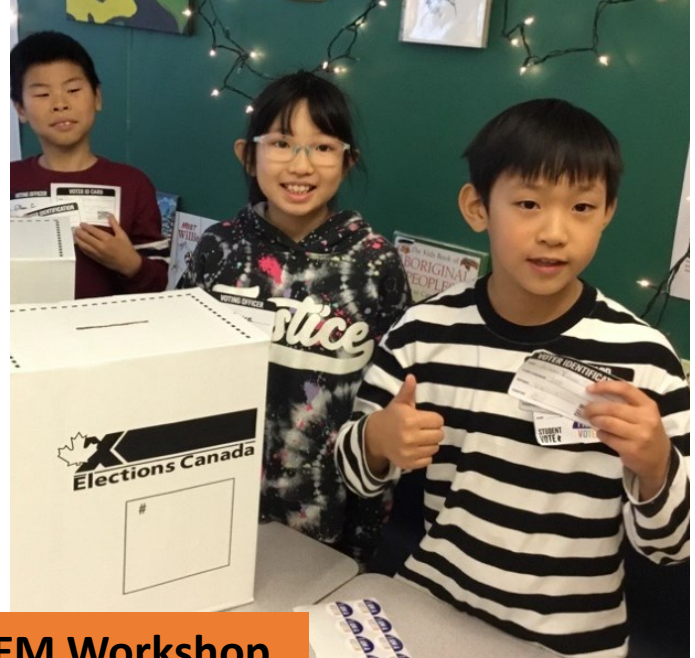
Div 5 & 6 @ STEM Workshop