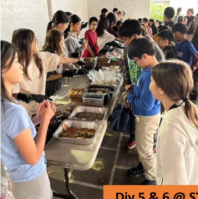
Grade 7 Bake Sale