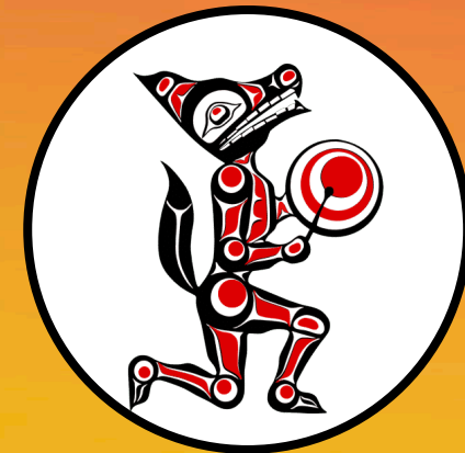
səlilwətał (Tsleil-Waututh Nation)