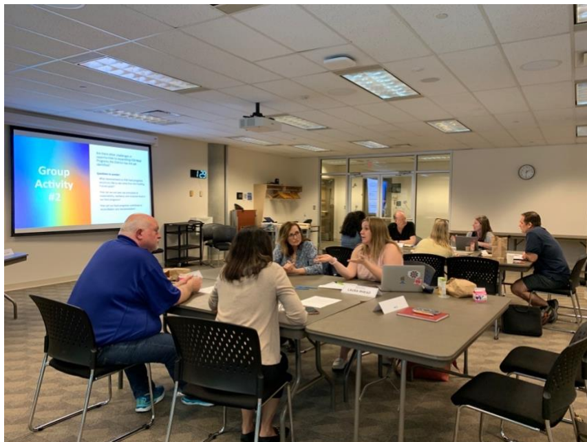
Stakeholders engaged in discussion during the Feeding futures workshop.