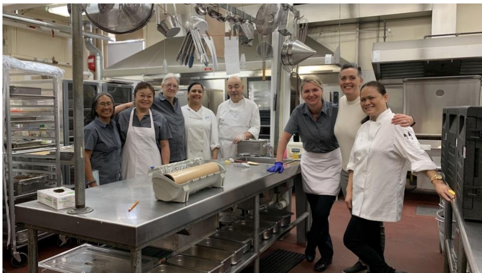
Commissary kitchen staff at Templeton Secondary School.

There are currently 700 students in the District who receive breakfast each day and more than 3,100 students who receive lunch each day in one of the 69 schools that have a VSB meal program. Every effort is made to source food locally and use food that is in season. Breakfast programs at seven elementary schools and eight secondary schools are prepared on site. Lunches are prepared at two commissary kitchens, located at Templeton and Britannia secondary schools. Templeton currently prepares hot lunches and Britannia prepares cold lunches. An equipment upgrade planned for Britannia this summer will enable the preparation of hot lunches starting September 2023. Funding from the Feeding Futures grant will ensure more students are fed daily.