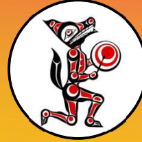
səlilwətał (Tsleil-Waututh Nation)