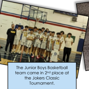
The Junior Boys Basketball team came in 2nd place at the Jokers Classic Tournament.