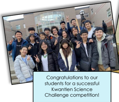
Congratulations to our students for a successful Kwantlen Science Challenge competition!

We have been doing several things in and for our community! A couple of highlights this month: