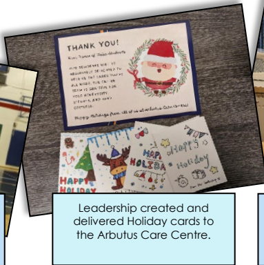
Leadership created and delivered Holiday cards to the Arbutus Care Centre.