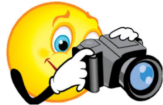
Photo Day is a bit earlier this year. It will be conducted on Monday Sept 20 th , by Mountain West studios in our library. Students not present for the photo will be offered a re-take day at a later date.