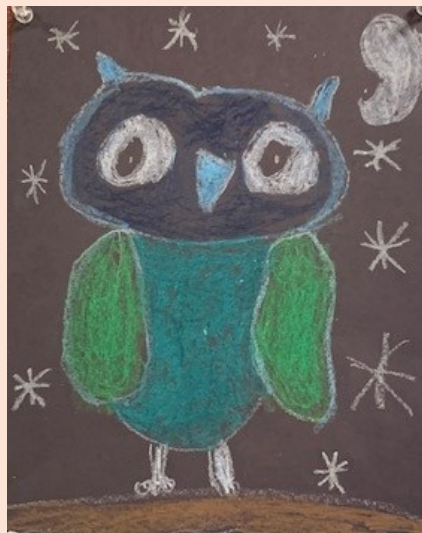
Big Boy Blue