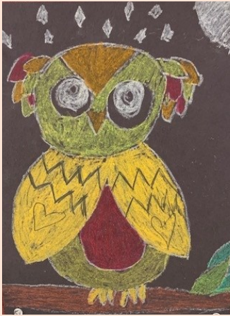
Elly Emerald Owl the 1 st