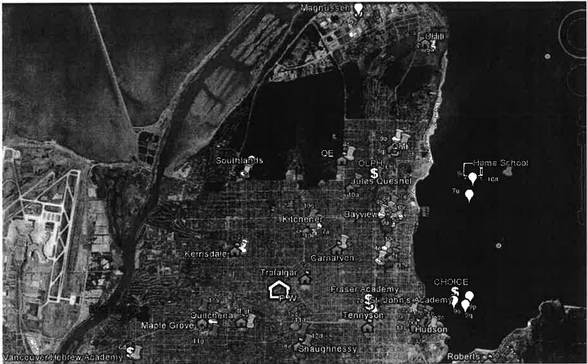
Map 1 - GOLD Referral History of Vancouver Elementary Schools