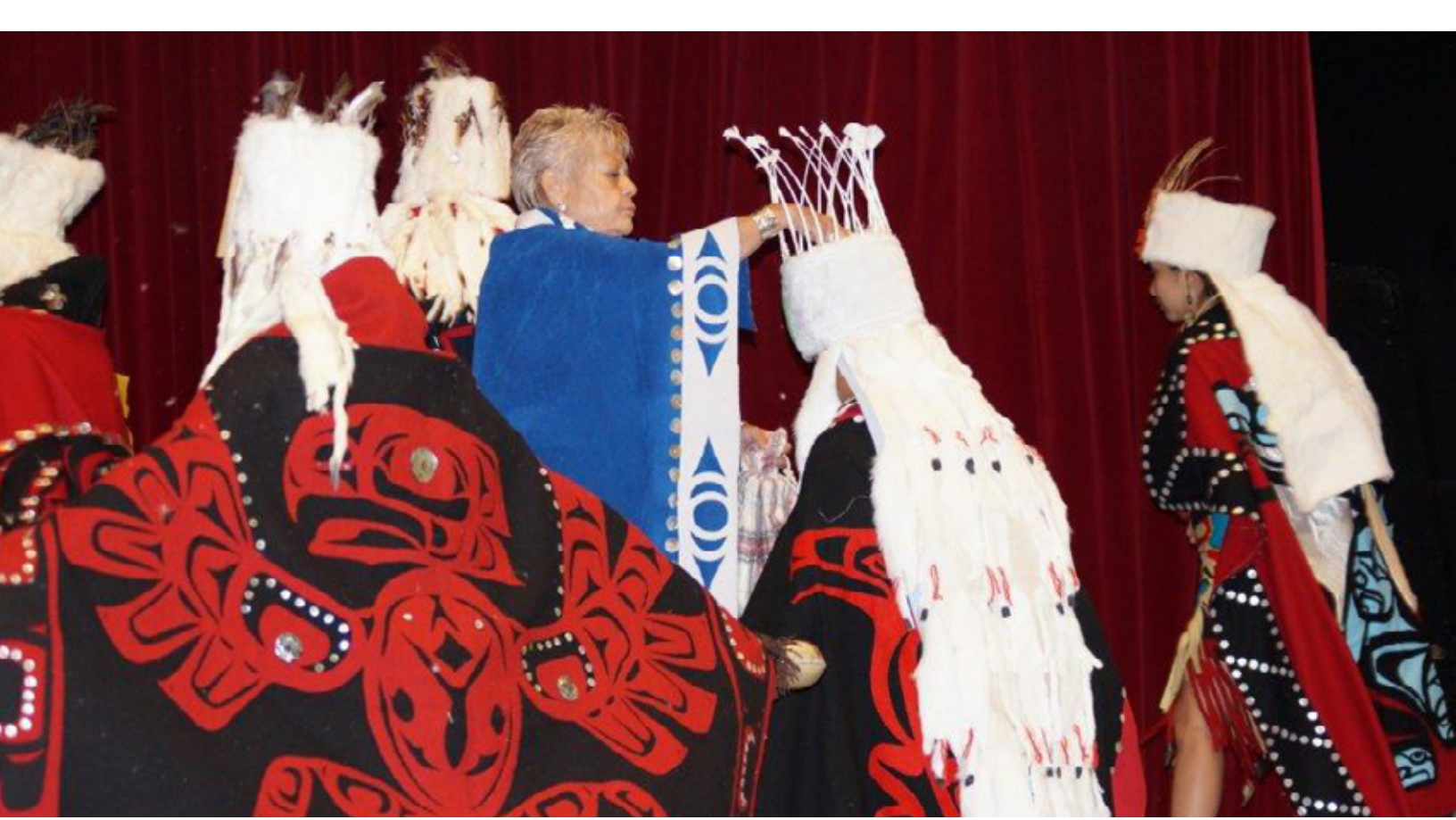
Aboriginal Grade 12 Graduation Ceremony