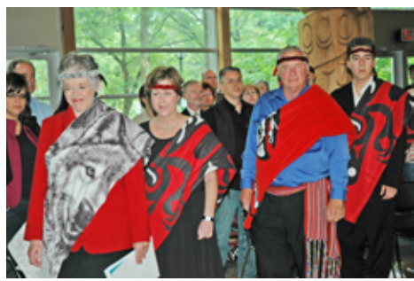
Photos above: signing of the Vancouver School District's first AEEA (June 25, 2009)