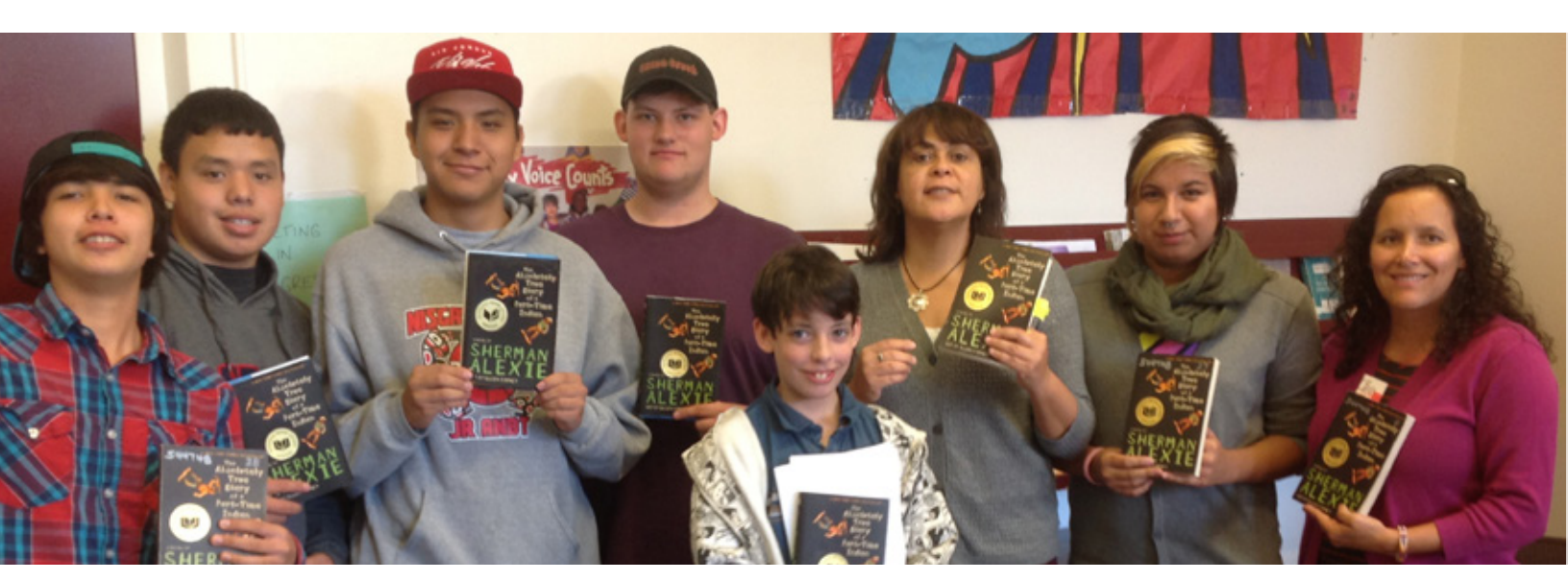
Brittania Secondary Aboriginal Book Club