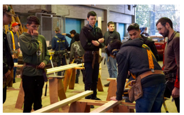
First Nations Trades Sampler - Over 40 youth of Aboriginal heritage from Vancouver and across the Lower Mainland spend the day at John Oliver Secondary working with industry professionals.