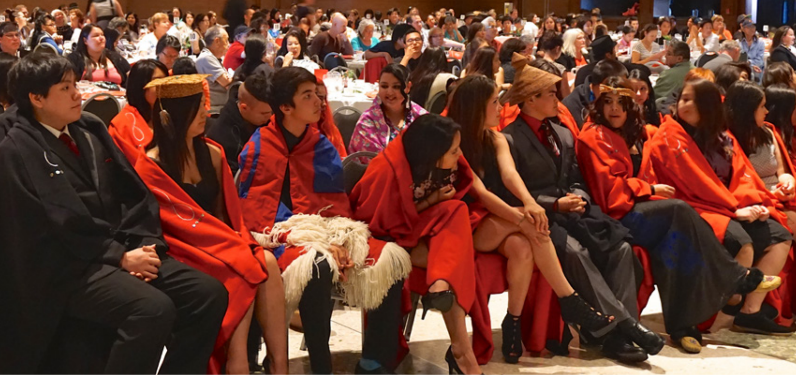
2015 Aboriginal Graduation Celebration

(2005) and others who have done extensive research on Reading Recovery. At present there are 52 of the 92 elementary schools in Vancouver that have Reading Recovery programs.