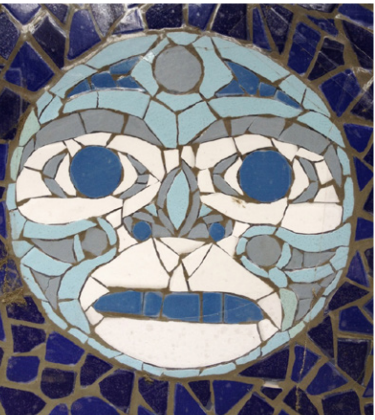
Grandview/¿uuqinak'uuh Elementary School tile mural.

issue at all levels of the K-12 system. The District is implementing an attendance strategy to track and improve attendance for all students. Recognizing that there may be different reasons for attendance issues amongst our Aboriginal students, our Aboriginal staff will be working with school support staff to ensure that these issues are recognized and supported in a sensitive and appropriate manner.